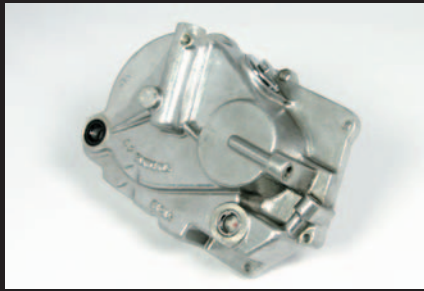
Applicable clutch cover